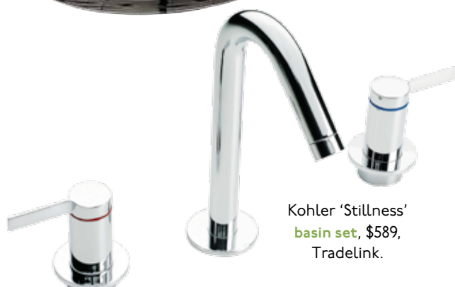
Kohler 'Stillness' basin set, $589, Tradelink.