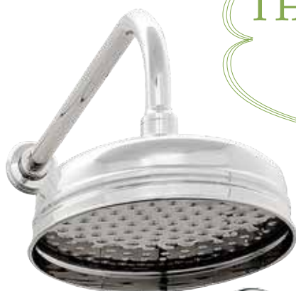
Perrin & Rowe shower rose with arm in Chrome, $610, Cass Brothers.