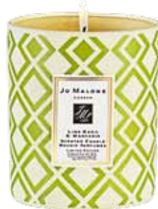
David Hicks candle in Lime, Basil & Mandarin, $105, Jo Malone.